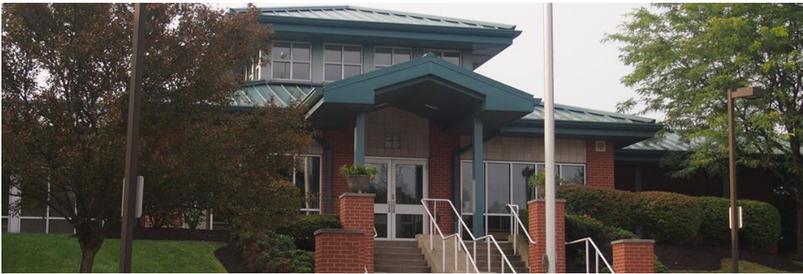
Bradford Woods Elementary School

T he mission of the North Allegheny School District is to prepare all students for success in a changing world.